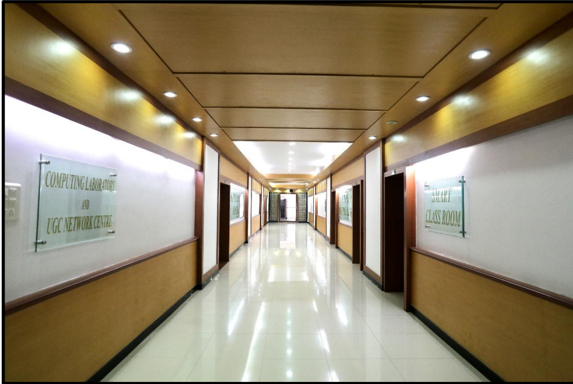
Commerce and Management Resource Centre

Ecosystem for Innovations, Creation and transfer of Knowledge