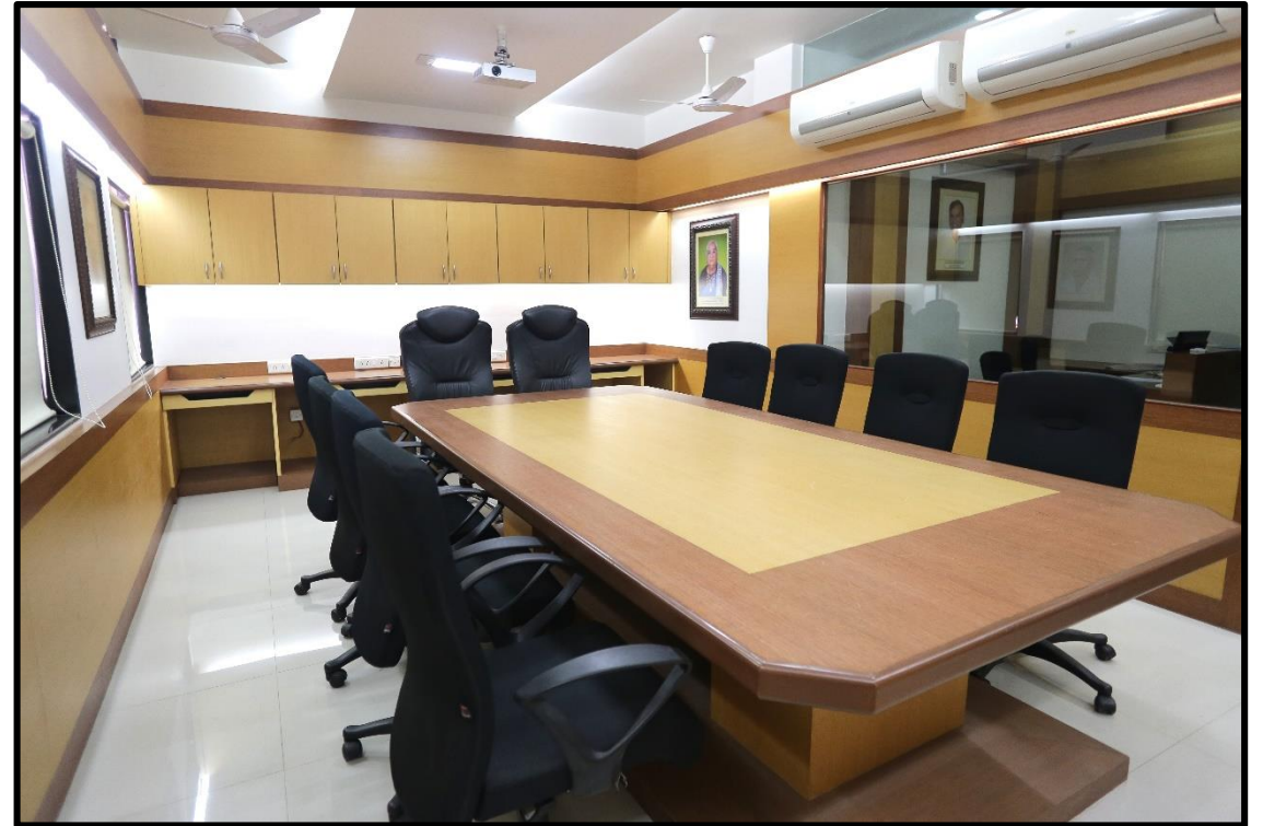
Conference Room for discussion