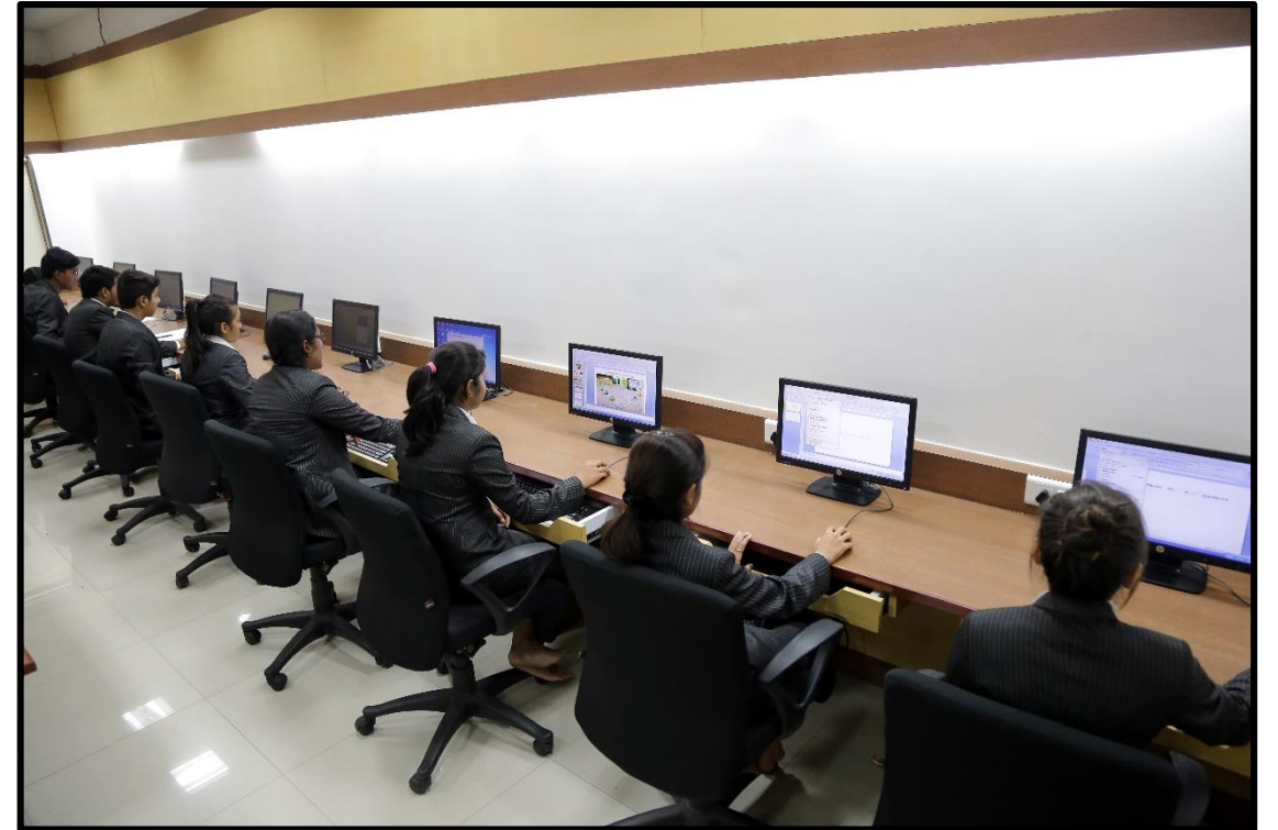
Computing Laboratory and UGC Network Centre