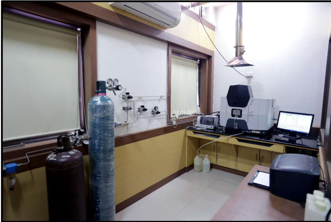
Atomic Absorption Spectrophotometer (AAS)