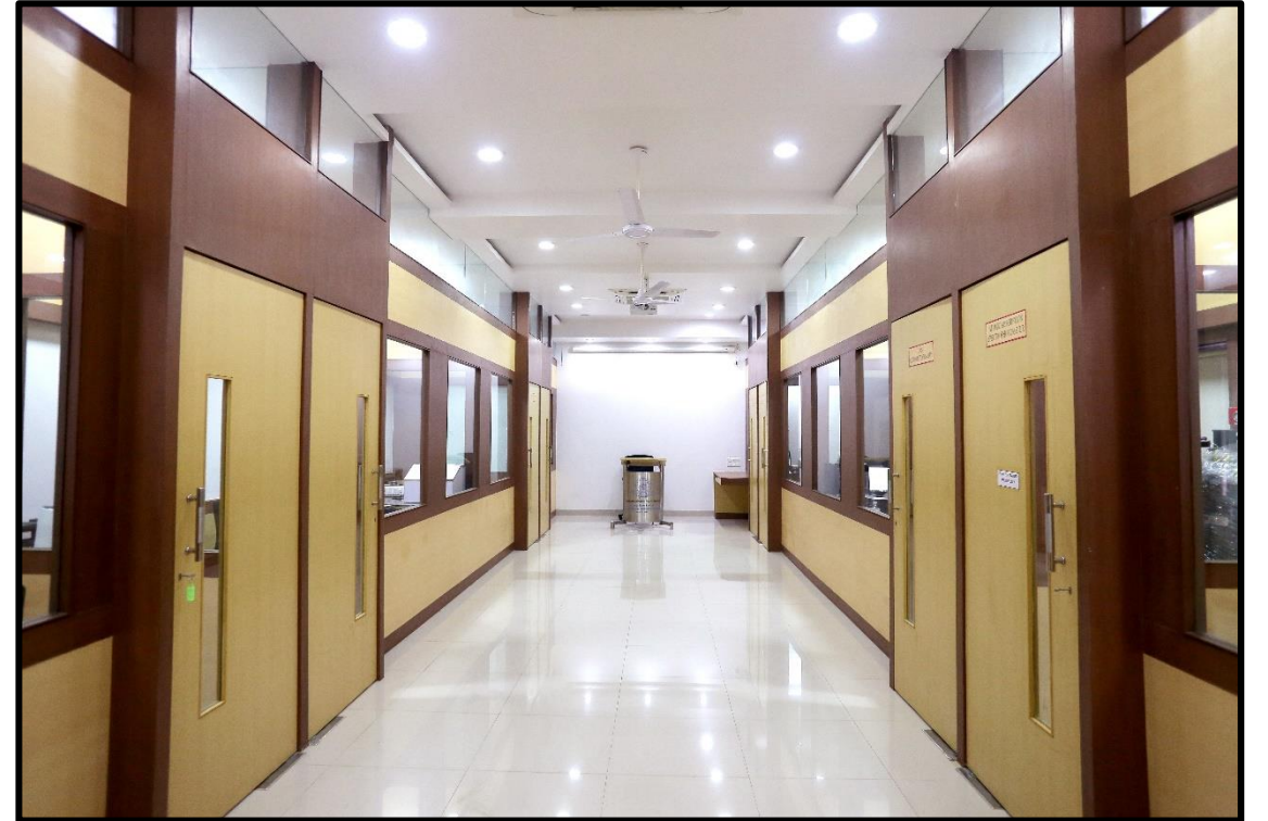
Science Resource Centre