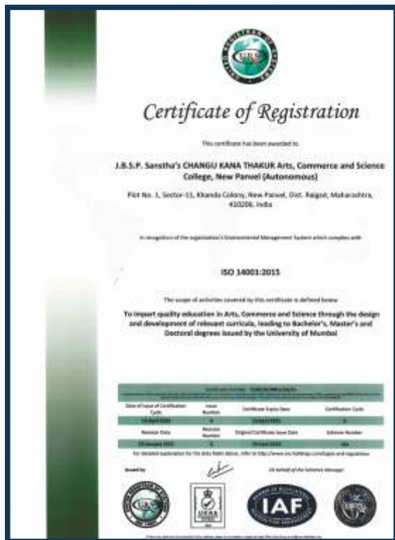
ISO 14001:2015 (Environment Management System) (2022-2023 to 2024-2025)