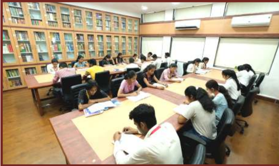
Library Reading Space