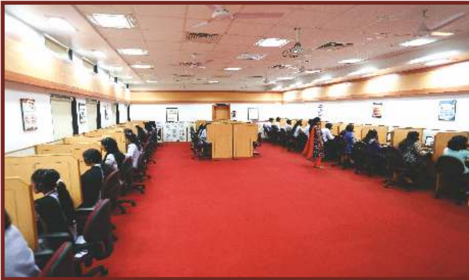
Interactive Language Laboratory