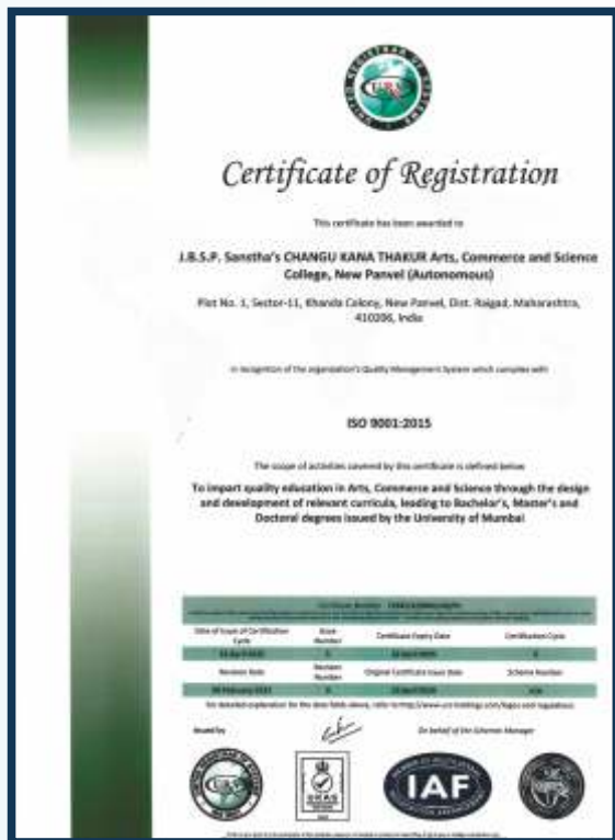
ISO 9001 : 2015 (Quality Management System) (2022-2023 to 2024-2025)