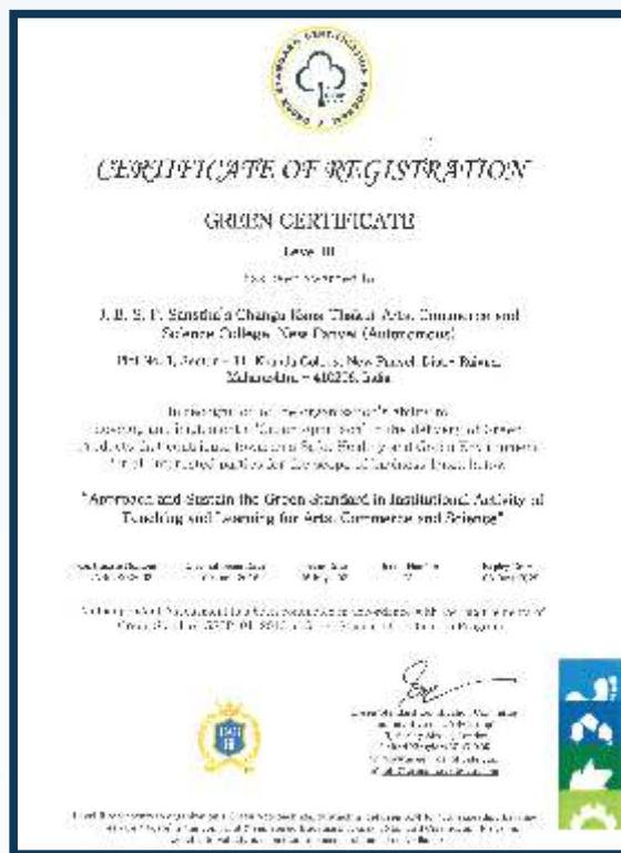
Green Certificate (2022-2023 to 2024-2025)